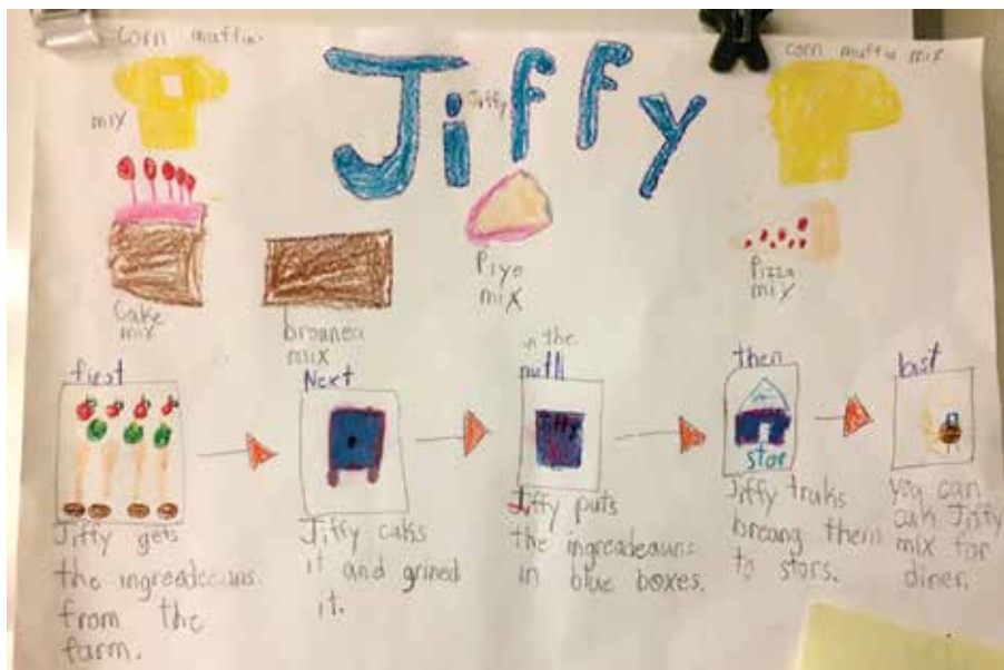
Figure 1: Draft Flier for the Economics Project

Our approach, tailored for the primary grades, followed several of the typical