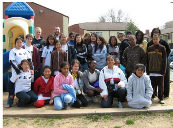
Members of the Global Youth Service Day Planning Committee join area youth at Bayview Community Center for a neighborhood clean-up