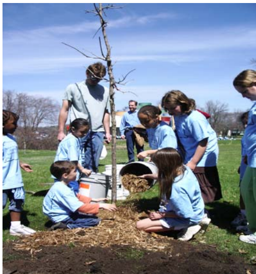
Global Youth Service Day at Warner Park, 2007