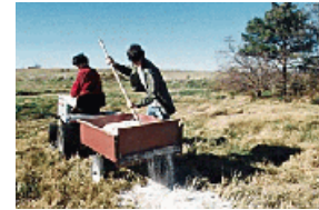
Figure 3. Spreading ground drywall.