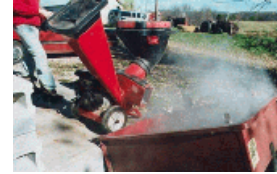
Figure 2. Onsite grinding of drywall

At new home construction sites ground gypsum drywall can be applied to the land surrounding the building site. Waste gypsum board needs to be pulverized in order to allow the drywall's absorption into the soil. Pieces smaller than ½ inch sq. can generally be applied to the soil. The shredded gypsum drywall should be spread evenly over the soil and must be applied in areas with adequate drainage and aeration, so that no anaerobic reaction occurs. 63 Onsite application requires a mobile processing machine, as well as a mechanism to spread the shredded drywall.