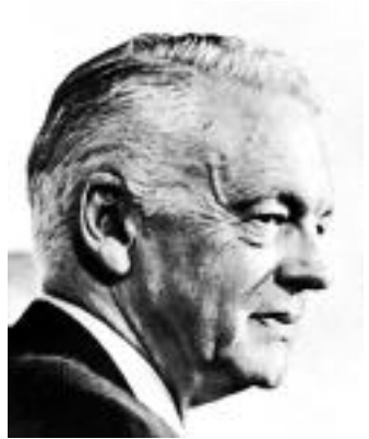
Robert M. Hutchins

T he tradition of the West is embodied in the Great Conversation that began in the dawn of history and that continues to the present day. Whatever the merits of other civilizations in other respects, no civilization is like that of the West in this respect. No other civilization can claim that its defining characteristic is a dialogue of this sort. No dialogue in any other civilization can compare with that of the West in the number of great works of the mind that have contributed to this dialogue. The goal toward which Western society moves is the Civilization of the Dialogue. The spirit of Western civilization is the spirit of inquiry. Its dominant element is the Logos . Nothing is to remain undiscussed. Everybody is to speak his mind. No proposition is to be left unexamined. The exchange of ideas is held to be the path to the realization of the potentialities of the race.