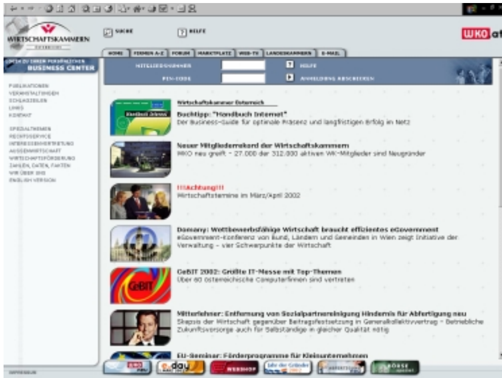
Figure 1: WKO Portal

platforms in Europe and a combination between eGovernment and eBusiness. (See Figure 1.)