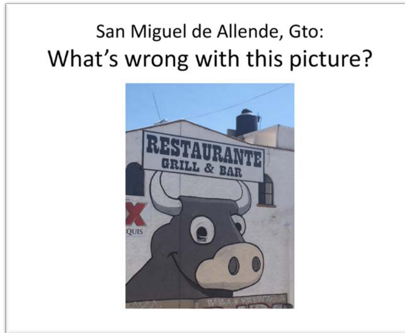
Figure 2. Example image for teaching a lexical phrase.

recently absent student returns to class, you might ask: “Have you been under the weather?” Or, when a student has been unusually quiet, you might invite him or her to speak: “Would you like to chime in?” To jog the memory, it might be a good idea to keep handy a list of such situations and matching vocabulary.